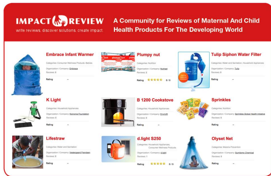
A sampling of products on the Impact Review site