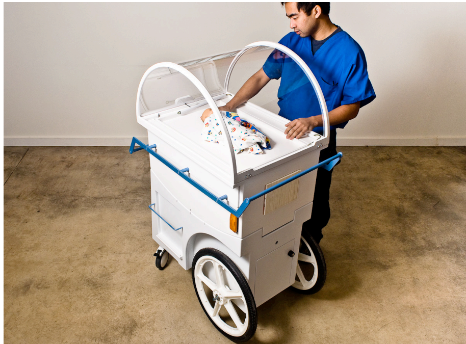
The NeoNurture car parts incubator