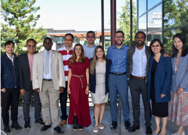
2023 Global Faculty Trainees