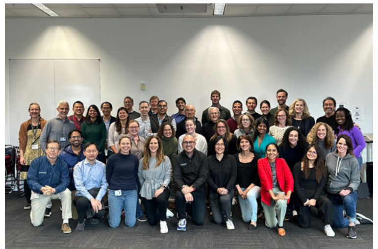
The program team