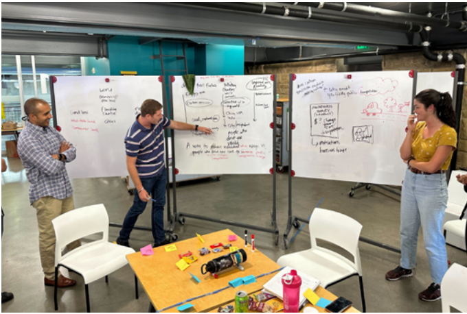
Design day at the d.school