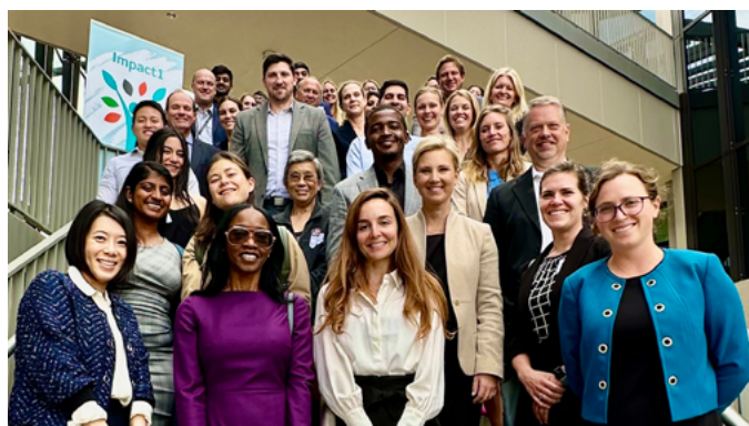
Attendees at the Impact1 summit

In October, the team hosted its inaugural CEO Summit, bringing together some of the top minds in pediatric healthcare innovation to share their successes and their struggles, and to foster collaboration within the community.