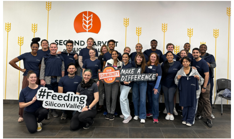
Volunteering with Second Harvest