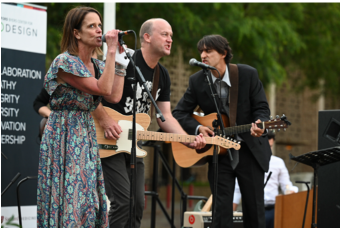
Biodesign's got talent