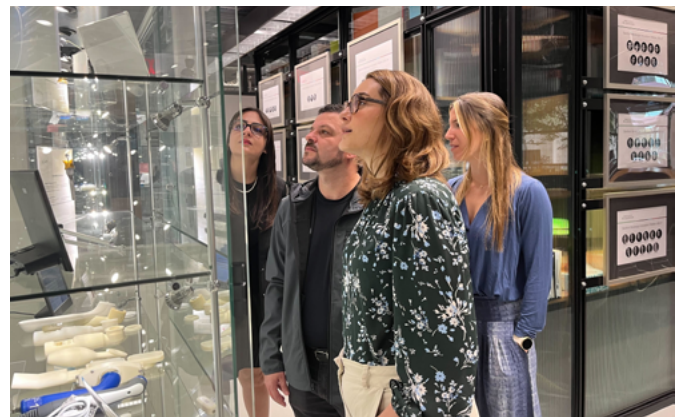
Einstein Fellows reviewing innovation display cases at Stanford Biodesign

2023 also saw the creation of our new Program Development Associate (PDA) offering — a mechanism to provide support and resources to other institutions interested in setting up Biodesign-like programs. Einstein Biodesign, founded in Brazil by former participants in our Global Faculty Training program, is our first PDA. In November, the first cohort of Einstein Fellows joined us for a week to learn more about the Silicon Valley health tech ecosystem.