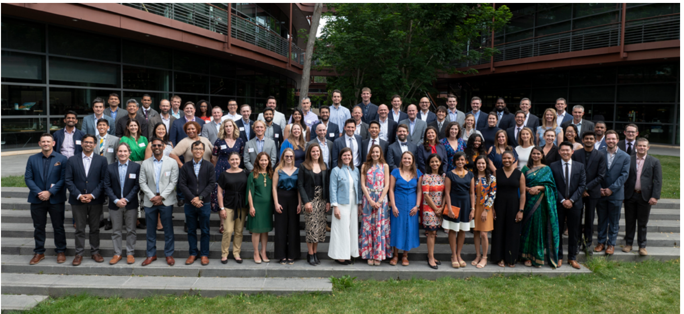
Innovation Fellowship alumni

Technologies invented by these trainees during their Stanford Biodesign training have helped more than 10 million people worldwide.